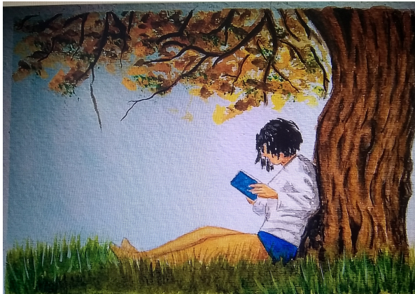
Under the Tree

Let me share with you some Sketch Paintings done with these colors: