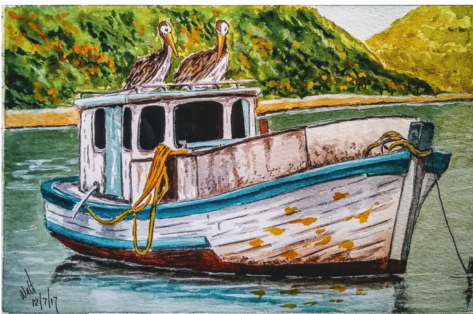
Old Boat Visitors

I truly hope this could be an inspiration to you, and drive you to experiment... I tell you, is not only very educational, but is extremely FUN!!!!